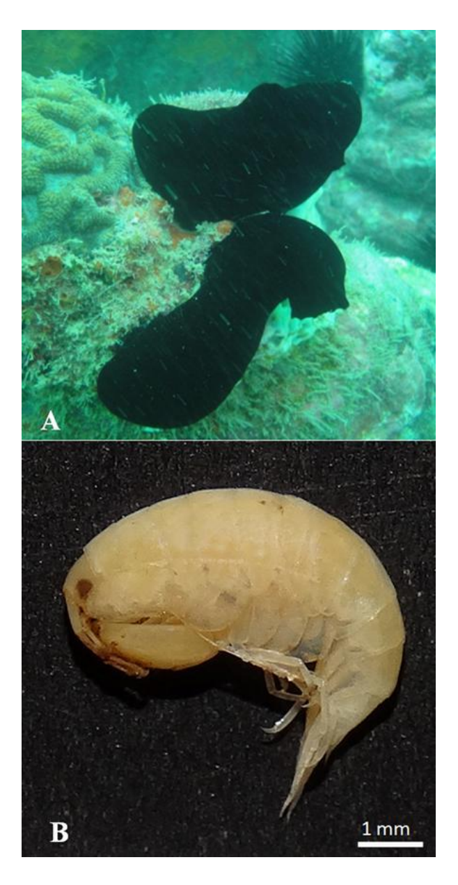
Figure 1. A. Phallusia nigra. B. Adult male of Leucothoe wuriti.

Ascidians (fig.1A) were caught manually on the wharf columns, at depths between 3.0 and 5.0 m, at Itaguá beach, Ubatuba municipality, in the northeastern coast of São Paulo State (23°27'07.S 45°02'49.W) (fig. 2), during daylight snorkeling sessions, in March, 2013.