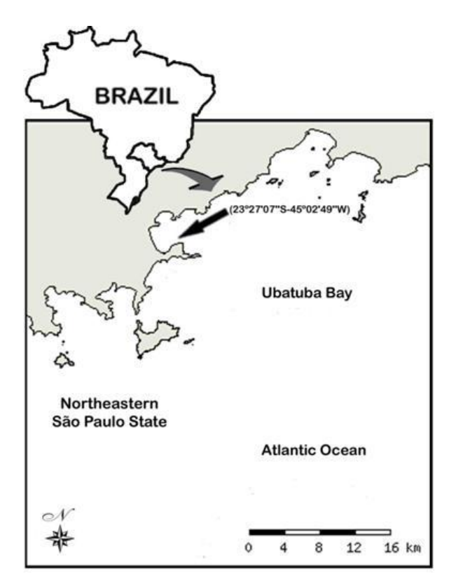
Figure 2. Studied area, indicating the sample site, Ubatuba, northeastern coast of São Paulo State.

The sampled ascidians were dissected and the amphipods removed, counted and preserved in 70% ethylic alcohol and stored before weight measurements. The ascidian internal organs were removed and dehydrated at 40°C by 24h, and weighted. Leucothoe wuriti (figure 1B) recognition was made according to the remarks pointed in Thomas & Klebba (2007).