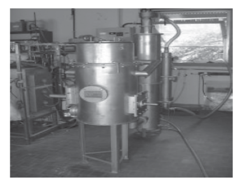
Figure 1 - Gasifier and gas filtration system

In this zone the gasification process is carried out at high temperatures in order to assure the cracking of any possible tarry residue. The gases are drawn off from the bottom and flow upward in the interspaces between the two coaxial structures. The external one is coated by an insulating material, while the internal is provided with additional exchange surfaces to improve the energetic balance of the gasification reaction and to reach the above mentioned temperatures (figure 2).