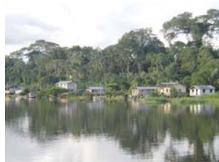
Figure 2 - Typical isolated community at Amazon State (CENBIO, 2004)

The gasification system developed in GASEIBRAS project will be installed at an typical isolated community, in Amazon State.